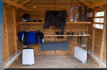
Daily Weather Report, Entertainment and Drying room