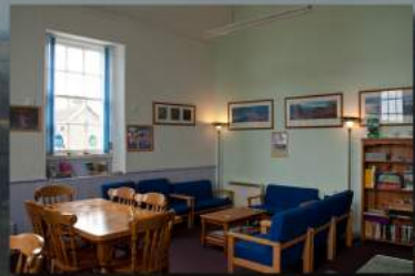
Dorms, Free WIFI and Communal Area